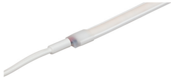
Fixture Cross-Section (enlarged to show detail)