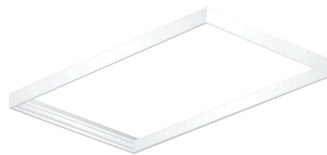
SMK-BLP-14 Surface mount kit for the 1x4 panel