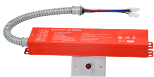
EM (PT-EMG-8W) Standard

PT-EMG-15W Low Voltage EM Battery (Additional cost)